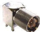
1.6/5.6 Male Right Angle PCB Part No: E30900PCB