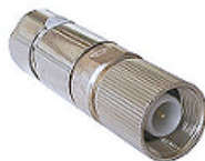
1.6/5.6 Male Straight Clamp Part No: E30600/CL/**