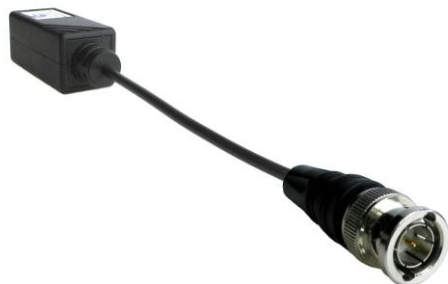
Video Balun BNC Male to RJ45 Part Number: E10180T