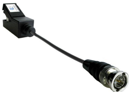
Quick Connect Video Balun BNC Male to IDC Part Number: E10180TC