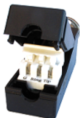
Rear View showing IDC