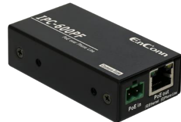
Receiver (Camera Side)