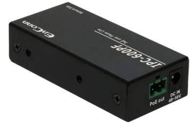
Transmitter (Network Side)