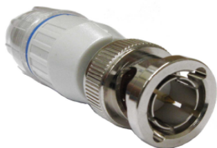
Tubular Easy Connect Video Balun BNC Male to Push Terminal Part Number: E10180V