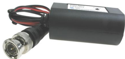
Power Through Video Balun BNC Male to RJ45 Jack with 300mm lead Part Number: E10524